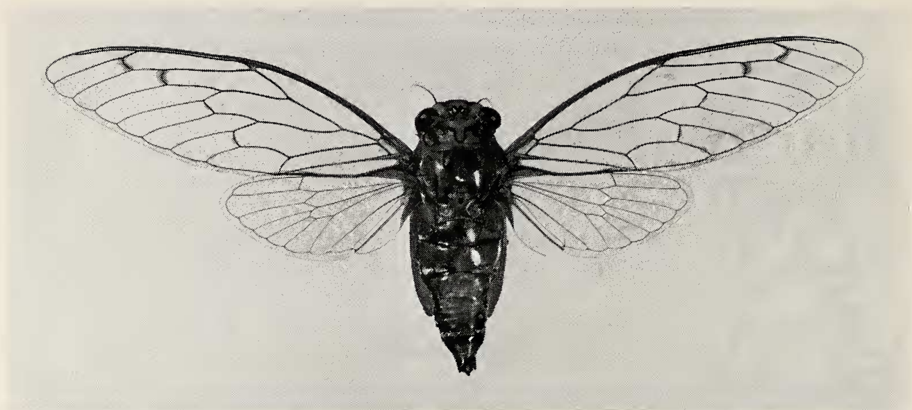
Fig. 8. Brachylobopyga decorata , holotype.

Pronotum. — Marking on pronotum black (fig. 2). A pair of paramedian, transverse, spots, which are sometimes connected, are situated immediately behind the anterior margin. In front of the pronotum collar there is a bowl-shaped figure of two diverging fasciae reaching to the posterior ends of the anterior oblique fissures; the posterior ends of these fasciae are just not connected. A narrow dark line runs distally along the posterior half of the anterior oblique fissure. The posterior oblique fissures are black. The rather broad, black colouration of the ambient fissure is restricted to the lateral bend and does not extend mediad of the black posterior oblique fissures. The anterior halves of the areas between the anterior and posterior oblique fissures are variably marked with black.